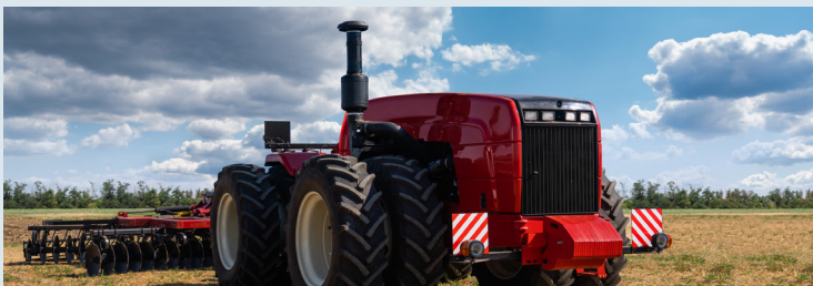
Autonomous Tractor in Smart Agriculture