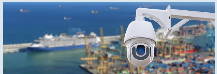
Video Surveillance in Ports and Garages