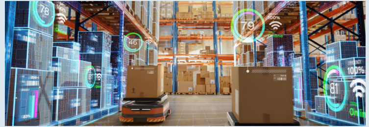
Scanner, AMR in Warehouses and Factories